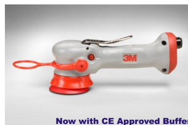
Now with CE Approved Buffer