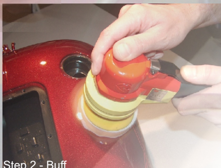
Step 2 - Buff

The fast, two-step way to eliminate minor clearcoat defects