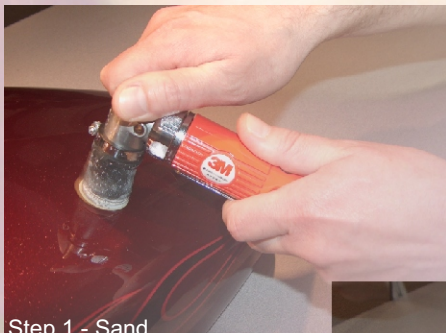
Step 1 - Sand